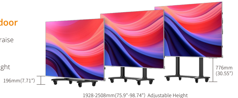
1928-2508mm(75.9"-98.74") Adjustable Height

Unrestricted by the size of the space, the screen can be easily passed through doors, elevators and so on by lowering the height of the screen or folding the screen.