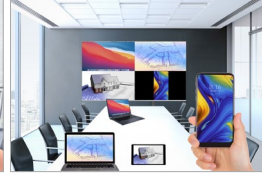
Wireless content sharing