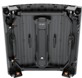
-45° convex state