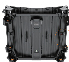
+45° concave state