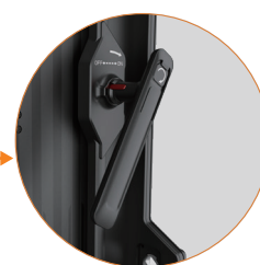
Angle adjustment operating handle