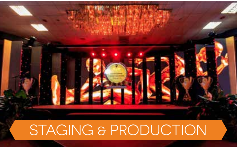
STAGING & PRODUCTION