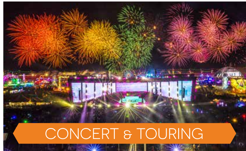
CONCERT & TOURING